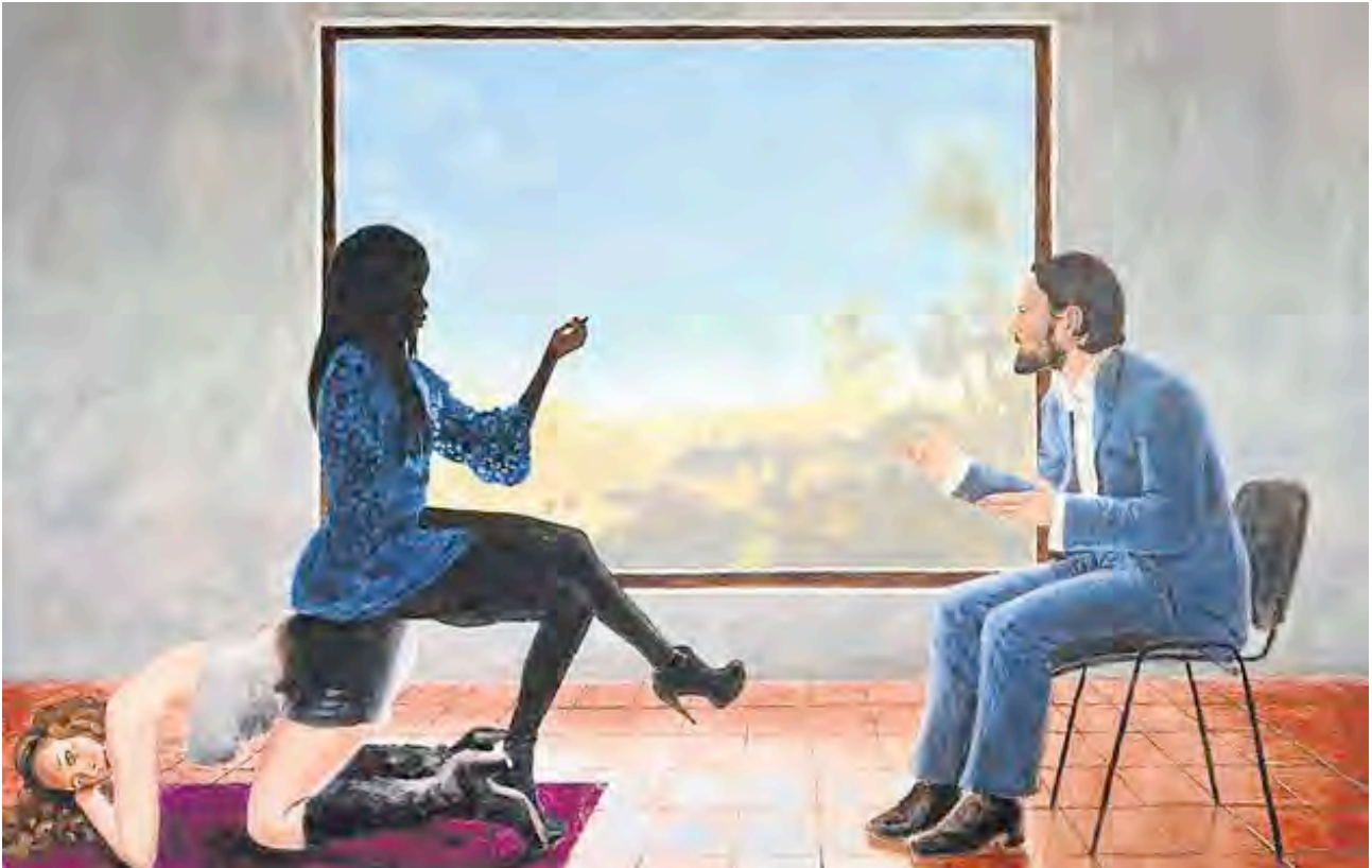
SITTING PRETTY: 'When Shall We 3?' by Kimathi Donkor

Mary Corrigan | 15 September, 2015 00:13