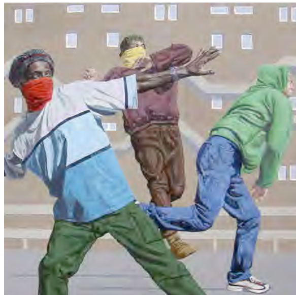
Figure 4. Kimathi Donkor, Coldharbour Lane 1985 , oil on canvas, 152 x 153 cm, 2005. © Kimathi Donkor.

[...] Another artist to document, or recall, the riots that had occurred at the other end of London, in Brixton, a week earlier than the riots sparked by the death of Cynthia Jarrett, was painter Kimathi Donkor. His Coldharbour Lane 1985 was painted some two