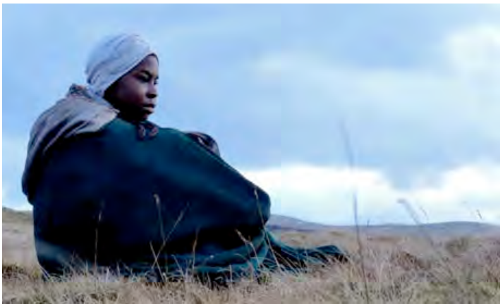
A scene from John Akomfrah's Peripeteia , 2012. A Smoking Dogs Films production, in association with Carroll/Fletcher and the European Cultural Foundation.

guardian.co.uk, Sunday 4 November 2012 11.00 GMT