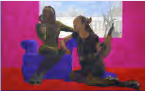
Kimathi Donkor, 'Drama Queen', 2010, oil on linen. Courtesy of the artist.

elements, and gradually working them into the composition. I also feel that we are living in an age of increased female empowerment.