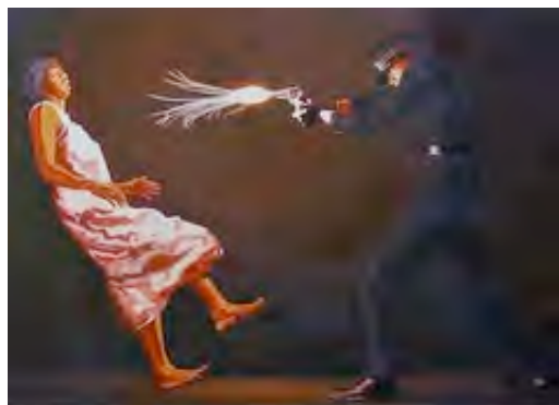
Kimathi Donkor, Under Fire , 2005, oil on linen, 47 1/2 x 71 1/2”.

In “Queens of the Undead,” a two-part exhibition of large-scale oil paintings on linen, artist Kimathi Donkor pays homage to historical figures that represent both authority and victimhood in equal measure. In the first part, the works portray heroic black women through the ages. When we shall 3? , 2010, for example, is a portrait from the series “Scenes from the life of Njinga Mbandi,” 2010; it depicts a moment during a seventeenth-century meeting with the Portuguese governor João Correia de Sousa, when Mbandi, the queen of Angola, refused to accept a floor mat as a seat, instead summoning a servant to bend over and act as her chair. This, when seen alongside equally vivid works that depict female leaders liberating their people, such as Harriet Tubman en route to Canada and Yaa Asantewaa inspecting the dispositions at Ejisu , both 2012, evokes the freeing power of authority.